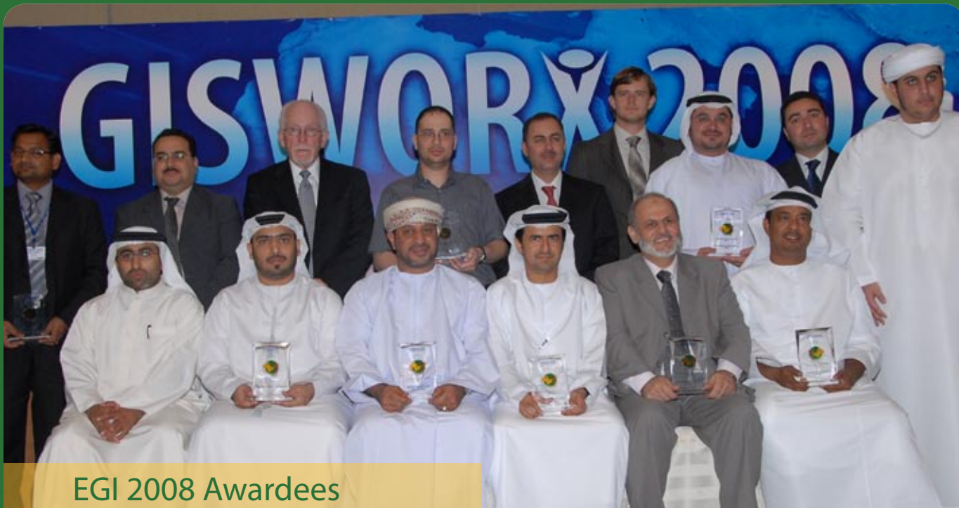
EGI 2008 Awardees